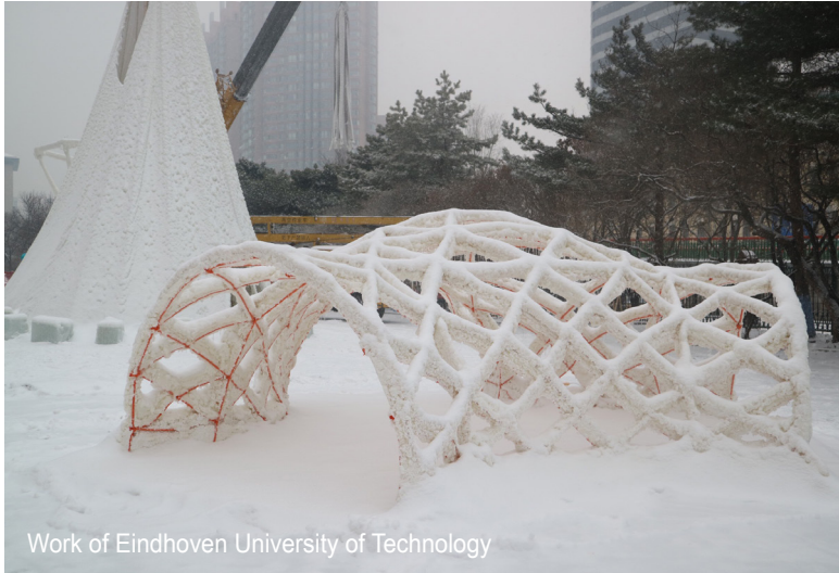
Work of Eindhoven University of Technology