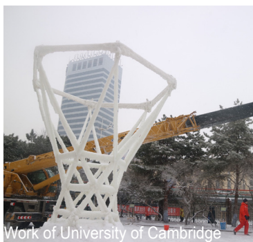
Work of University of Cambridge