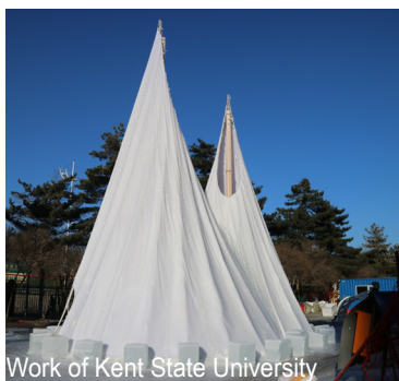
Work of Kent State University