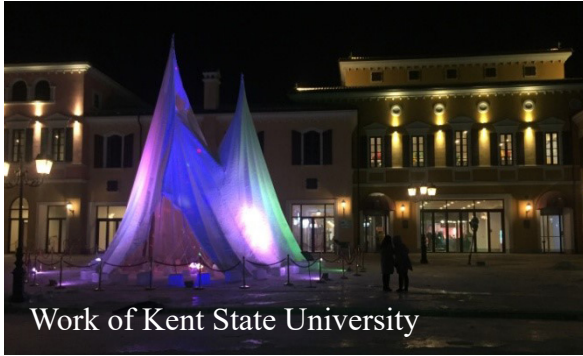
Work of Kent State University