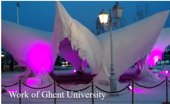
Work of Ghent University