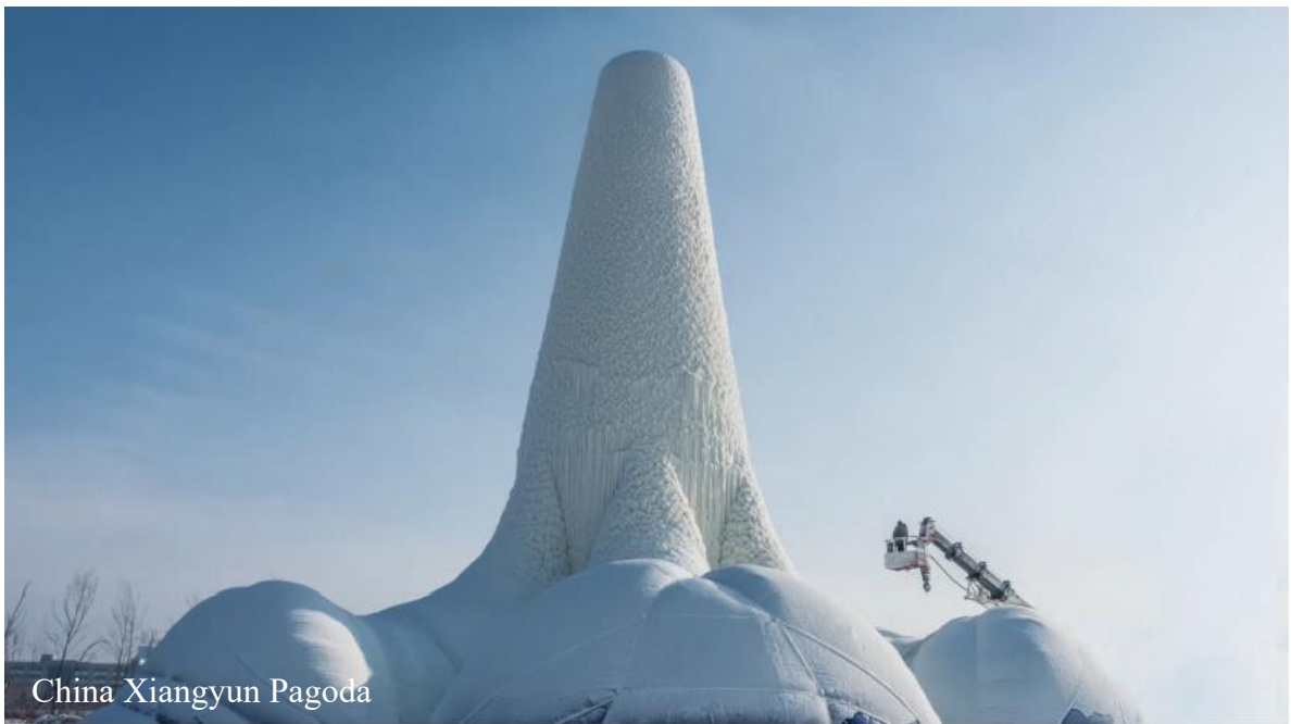
China Xiangyun Pagoda