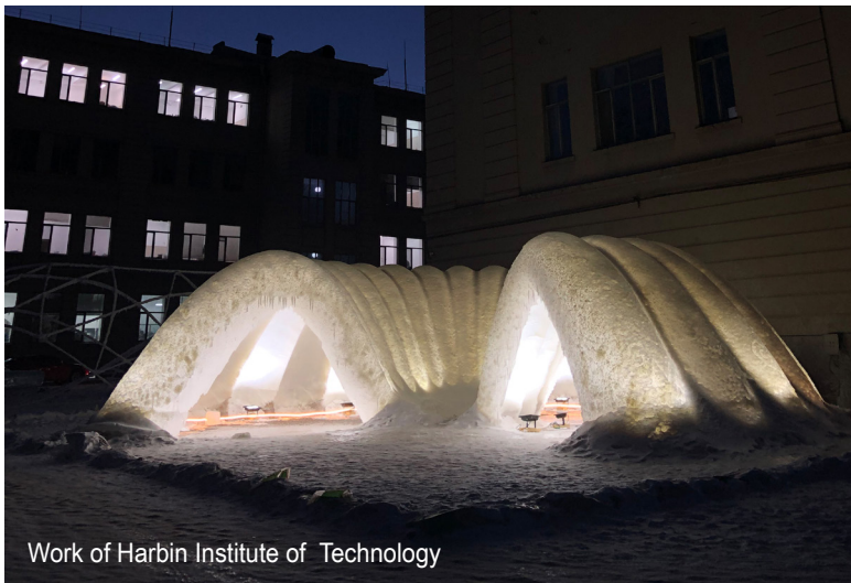
Work of Harbin Institute of Technology