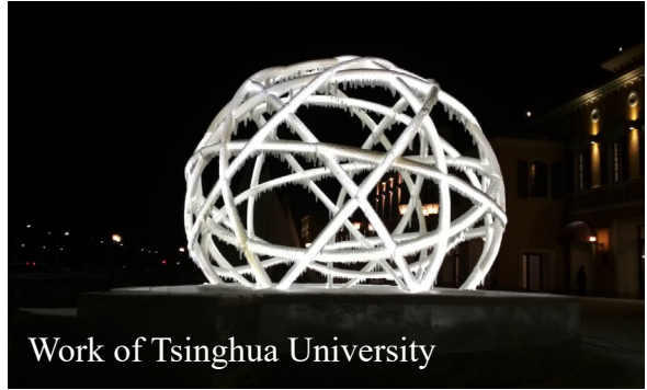
Work of Tsinghua University