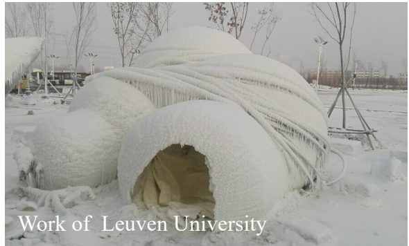
Work of Leuven University