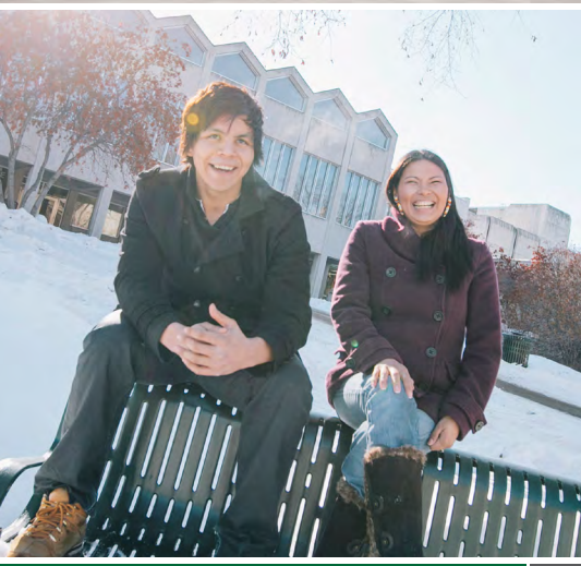
UNIVERSITY OF SASKATCHEWAN